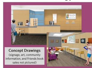
Concept Drawings (signage, art, community information, and Friends book sales not pictured)

We are excited to bring you a more open, user-friendly space!