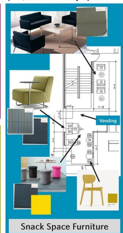
Snack Space Furniture